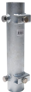
Installing on PN10800 Patriot Truss Frame - PN10810 - Steel Post Bracket Requires Qty. (2)

When installing without Patriot Docks mounting brackets, note the outside dimensions of the Handrail Vertical Support is roughly 1.9" (48mm). When using a different mounting bracket ensure inside dimension is larger than the outside dimension of the vertical pipe.