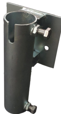
Installing on PN10835 Patriot Low Pro Frame - PN10937 - Steel Low Pro Post Bracket Requires Qty. (2)